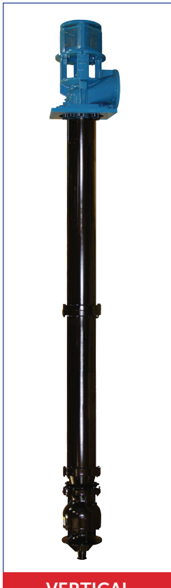
VERTICAL TURBINE PUMP