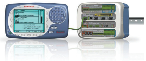
FLOW & LEVEL MEASUREMENT EQUIPMENT