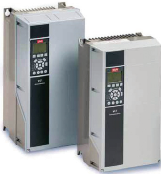
VARIABLE FREQUENCY DRIVES