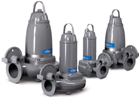
LIFT STATION PRODUCTS