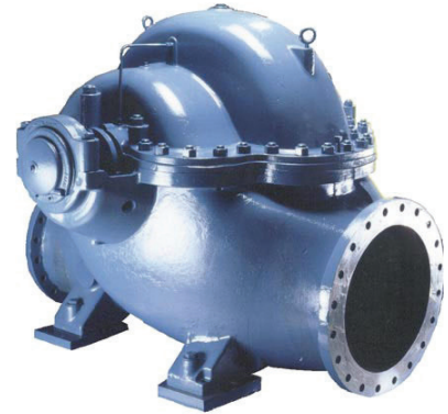
WATER PLANT PRODUCTS