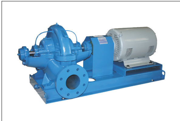
WATER PLANT PRODUCTS